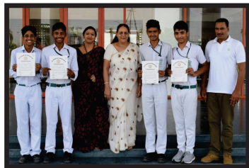
TABLE TENNIS TOURNAMENT